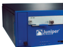
Juniper Networks ISG 1000