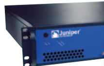
Juniper Networks IDP 1100