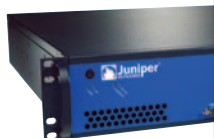
Juniper Networks IDP 200