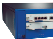
Juniper Networks ISG 2000