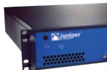
Juniper Networks IDP 600